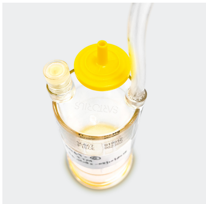
Figure 3: Representative image of the Sterisart® septum after 102 sample extractions.

Our results demonstrate that Sterisart® canisters remain a closed and sterile unit, even after successive sampling for a tested total of 102 extractions.