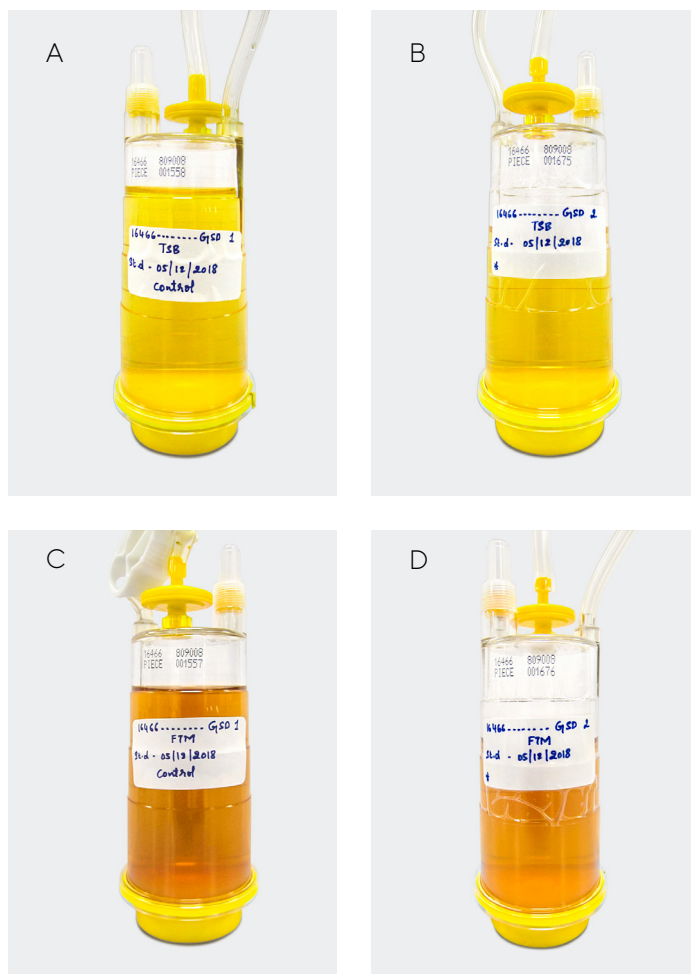
Figure 1: No microbial contamination after repeated sample extraction. Representative images of the Sterisart® 16466 GSD version filled with TSB (A and B) FTM (C and D) incubated for 24 days at 22.5° C and 32.5° C respectively. Negative controls are shown in A and C. Canisters in B and D were pierced 102 times for sample extraction.