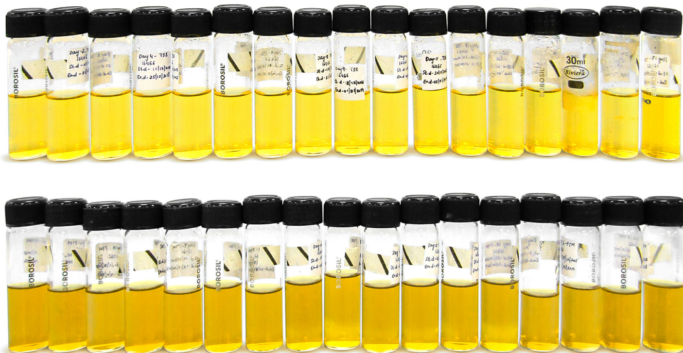
Figure 2: No microbial contamination in samples extracted from Sterisart® 16466 GSD after incubation in glass vials. Samples were inoculated into glass vials containing TSB (upper panel) and FTM (lower panel) were grown at 22.5° C and 32.5° C, respectively, for 14 days.

Coring can occur when a septum has been punctured multiple times or if an inappropriate needle type is used. Only after 36 piercings were small particles observed in some Sterisart® canisters. These particles were collected after 24 days on a black membrane filter and monitored for their ability to form colonies on TSA plates. These particles did not demonstrate any growth even after an incubation period of five days, suggesting that these particles are not biological in nature. Based on their morphology, we conclude that these inert particles are fragments of rubber that are sheared off the septum during repeated piercing with syringe needles. These fragments do not influence the efficacy of the sterility test and are barely visible in the growth medium.