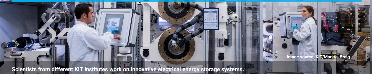
Scientists from different KIT institutes work on innovative electrical energy storage systems.